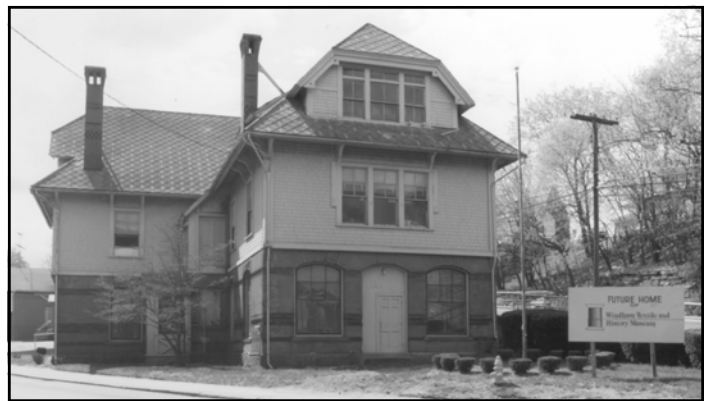
The Museum's main building when we acquired it in 1989.

The Museum is also inaugurating a new lecture series, called "Tea & Talk" (see p. 2).